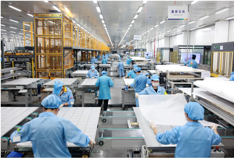
Workers at a solar-panel factory in China’s Zhejiang province.

Ever since the Korean War, Beijing has seen dependence on petroleum imports as a major strategic weakness. In recent years, that danger has been dubbed the “Malacca Dilemma,” referring to the narrow strait leading past Singapore and into the South China Sea. The risk in Beijing’s eyes is that, in the event of a confrontation with the U.S. over Taiwan or the South China Sea, the U.S. Navy would shut the strait to tankers carrying China’s oil imports from the Mideast and Africa, immobilizing large parts of China’s economy and military. Reducing the country’s dependence on imported oil will be a big strategic win for China.