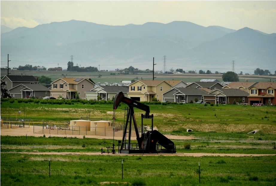
An oil derrick in Dacono, Colo.

not until a century later, in the 1960s, that oil replaced coal as the world's top energy resource.