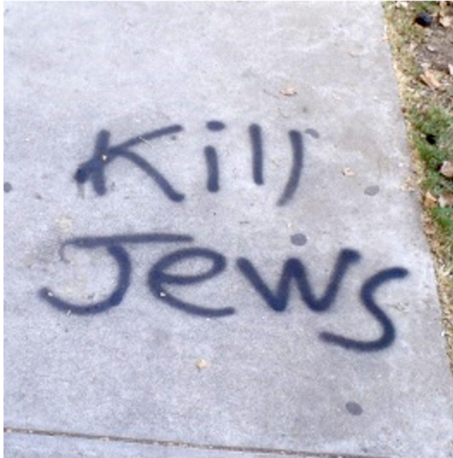
Figure 2a: Image sent from President Cauce as “proof” of antisemitic graffiti.