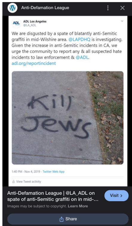
Figure 2b: Result of image search, showing this image is from California, 2019.