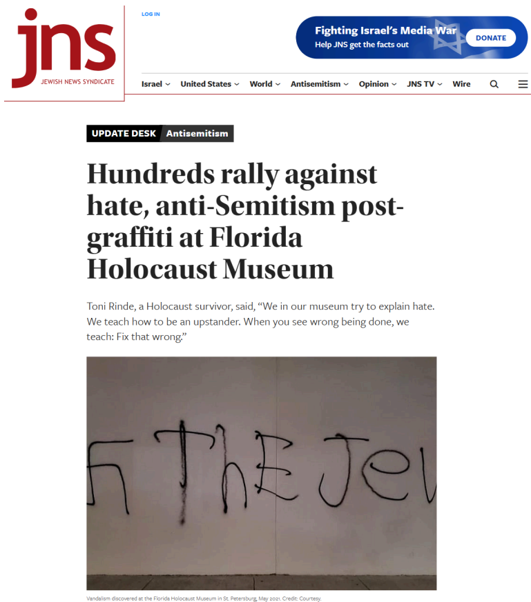
Figure 1b: Result of image search, showing this image is from Florida, 2021.